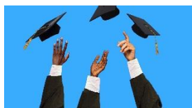
University Grade Inflation to cease