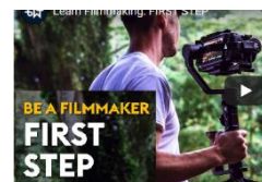
Free Film School